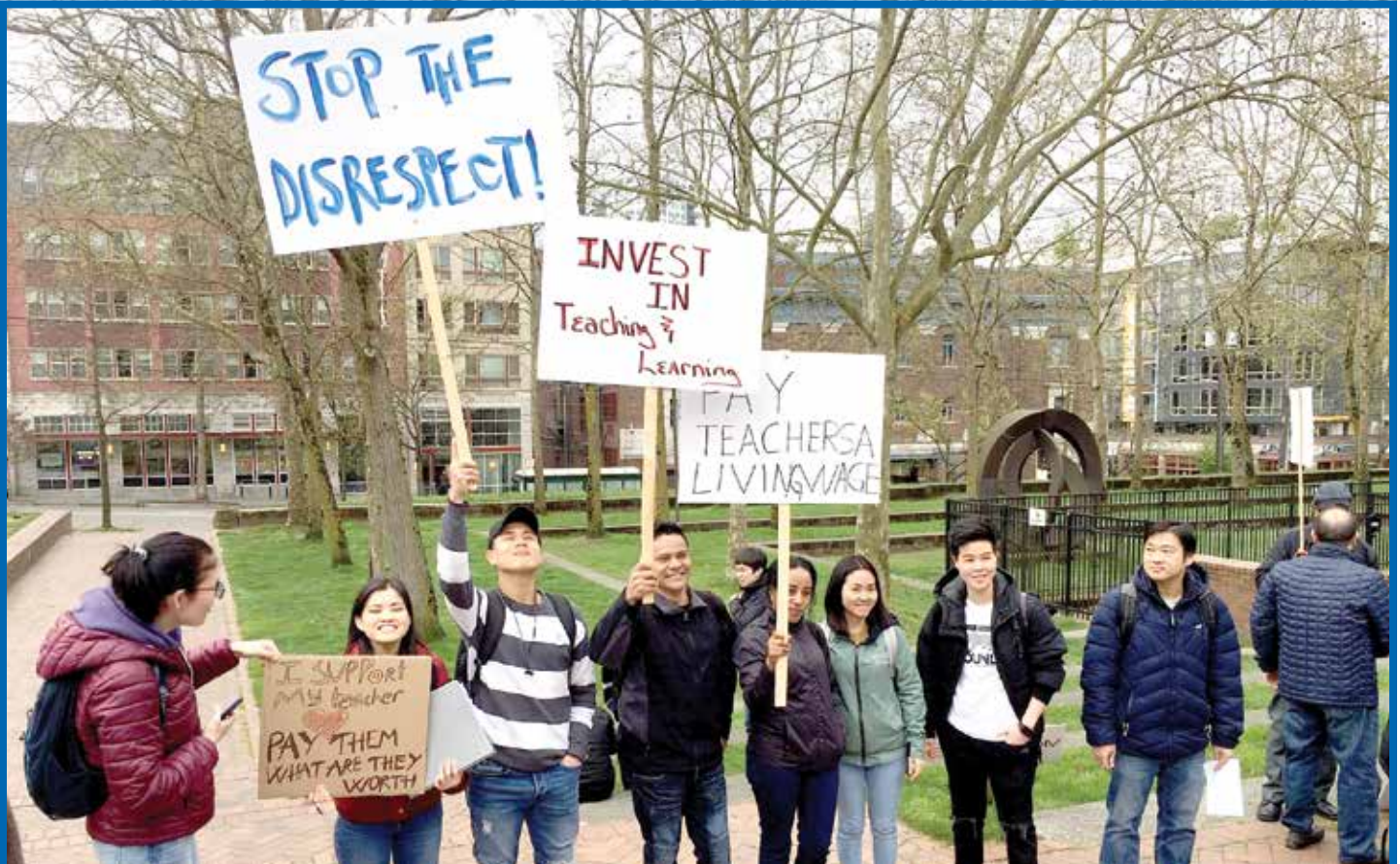
Students at Seattle Central College supporting the April walkout, held as part of the [Re]Invest In Our Colleges campaign