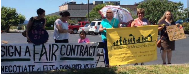
July 2016, Familias Unidas por la Justicia negotiates first contract