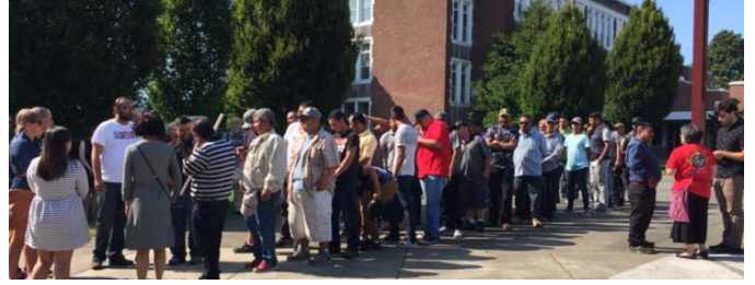
H-2A workers gather for community blessing, Bellingham, August 2017.